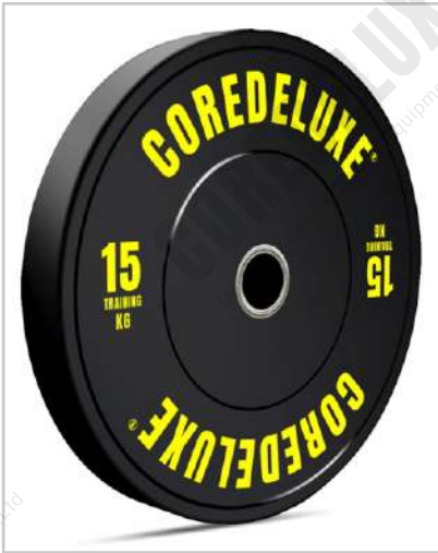
15KG 47MM TRAINING