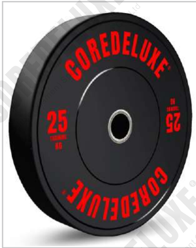
25KG 70MM TRAINING