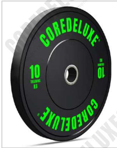
10KG 34MM TRAINING