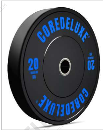
20KG 58MM TRAINING